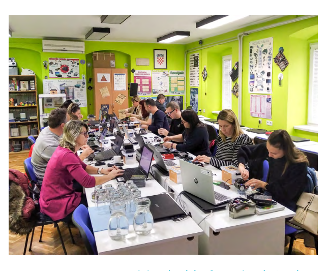
Workshop / training for teachers in Croatia on how to use robots and AI cameras in school, part of the curriculum developed jointly by EWC and IRIM

In 2022, 430 schools were involved in the project, which is supported by EEA Norway grants Local Development and Poverty Reduction program in Croatia.