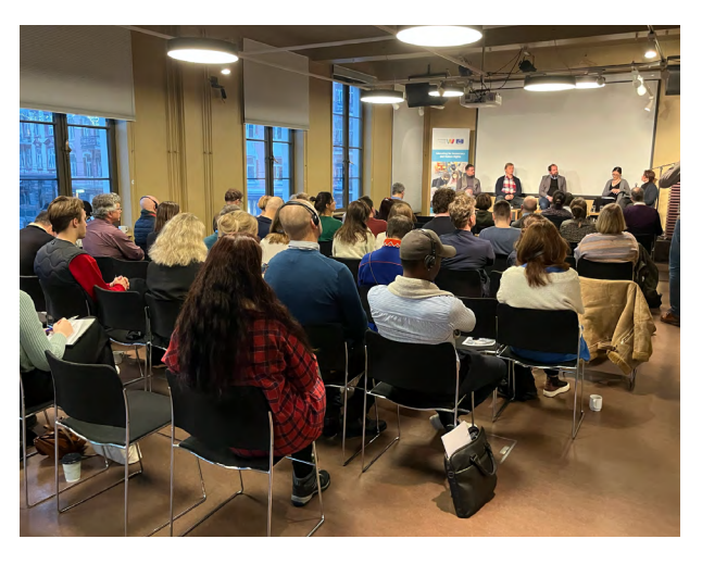
EWC invited Norwegian and Russian experts to the seminar "Education in Putin's Russia"

Financed by the Norwegian Ministry of Foreign Affairs.