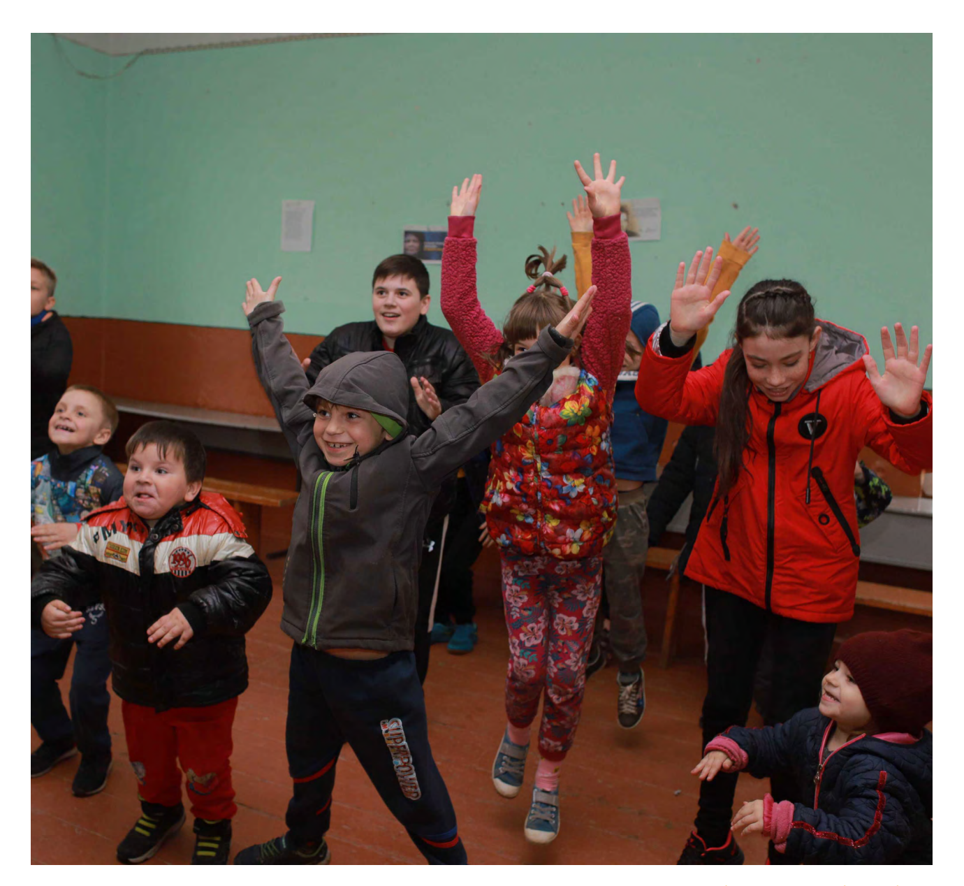
Mobile Youth Work meeting focusing on integration of IDPs in the Lviv region

The project "Schools for Democracy" is financed by the Norwegian Minsitry of Foreign Affairs.