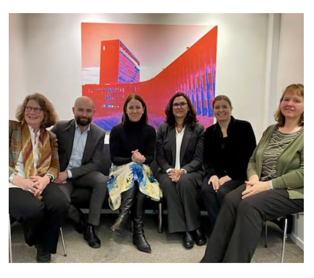
The directors of the network's centers meet Norway's Minister of Education

As part of the event, we shared our experiences from the "22 July and Democratic Citizenship" program. We have learned, for instance, that young people's trust in themselves as democratic citizens increases when they carry out