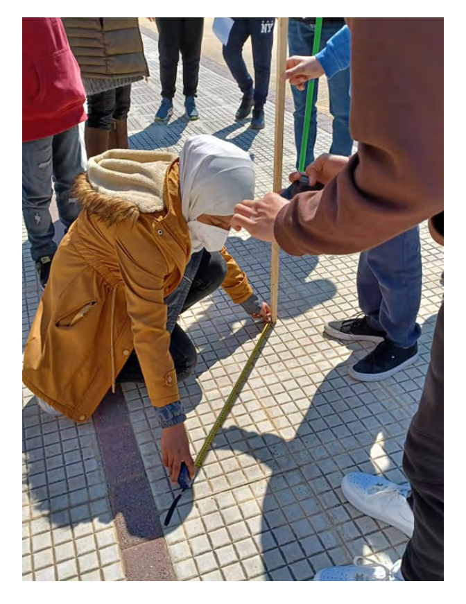
Schools for All activity for the geography and physics class 2nd Gymnasium of Samos

"When a supportive educational framework is created and schools are supported with appropriate educational programmes, every child and young refugee can realize his or her goals and dreams."