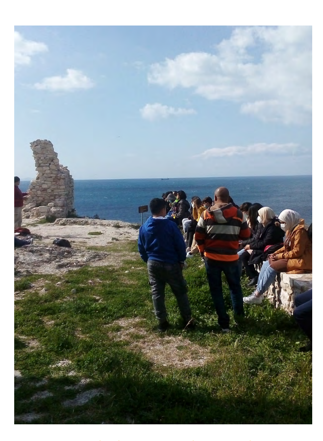
Historic walk for the national celebration of 25 March 2nd Gymnasium of Samos