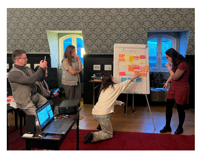
Mapping of relevant actors during the workshop in Oslo in November 2022