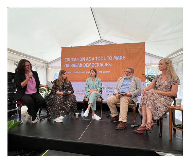
Every year, the centers join forces during the Norwegian political festival Arendalsuka, holding several events in the Human Rights Tent

The directors of the centers met with Norway's Minister of Education Tonje Brenna twice in 2022.