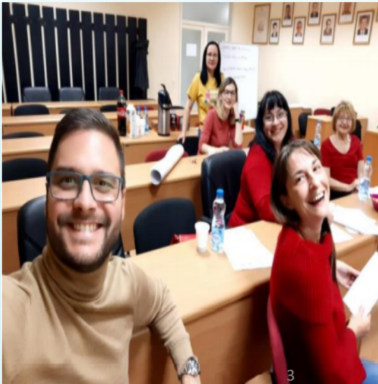
Training for teacher mentors, University of Nis, Serbia.

„The greatest lesson so far and most important experience is the possibility of working collaboratively with colleagues and associates from the region. That is a wonderful group who have dedicated their teaching and learning to create critical learning possibilities for their students, and to be the change agents in their communities. This project enables teacher educators and prospective teachers of different subject to disseminate innovative practice in their classrooms and in their professional development, which makes participation in this group of learners and teachers a unique, inspiring and precious experience“. Change Story 2020