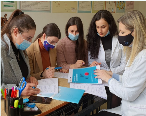
Teacher mentor school activity in Durres, Albania

„Participation in this project has greatly increased my competences for mentoring. I got the opportunity to be in the role of someone who not only transmits knowledge related to the content being processed, but also the form. This includes many details that I was not even aware of, which I now realize is crucial in the process of knowledge transfer, not only for students but also for future teachers.“